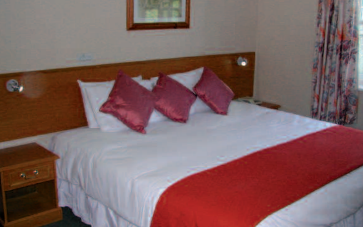
Service and Value