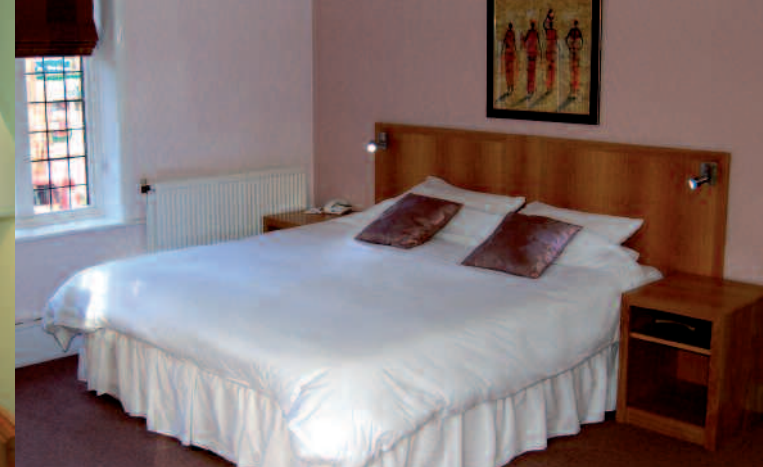
History and Character